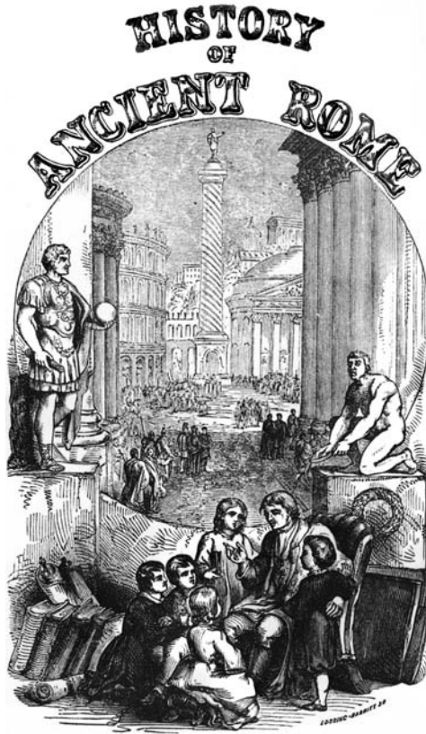
Figure 7. Girls and boys learning about ancient Rome. Engraving opposite the title page of Samuel Goodrich, A Pictorial History of Ancient Rome (1848; New York, 1850).

and the United States, were aimed at an increasingly diversified audience that explicitly included middle-class women and children. Some were prominently entitled “family” editions of classical texts; one author was listed simply as “A Mother.” The title pages of some best sellers, such as Samuel Goodrich’s Pictorial History of Ancient Rome (1848), now drew attention to the presumed readers—boys and girls of a modern republic. (See figure 7.) 25