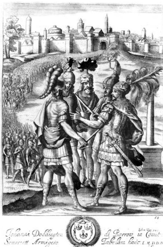
Figure 4. Trojan soldiers assembling for battle. From John Ogilby, Homer, His Iliads (1660; London, 1669).

A hodgepodge of time periods that jars the modern viewer, Ogilby's picture of an ostensibly ancient Mediterranean conflict conformed exactly to the conventions of pastoral landscape in the 1600s. The landscape presents a world of nature and civilization unruffled by human passion, even on the brink of battle. The city, the obelisk, and the costumes symbolize, not an actual historical time, but the ideal of life ruled by the orderly workings of society. Nobles calmly lead, soldiers neatly follow, tranquillity is restored. Pictures of actual combat in Ogilby's Iliad dwell on similar themes drawn from the pastoral tradition. The gods, described as "the Court," lounge on billowing clouds and gaze down at a scene of shocking carnage, though the combatants wear expressions that display the Christian virtues of compassion and gentleness. (See figure 5.) 19