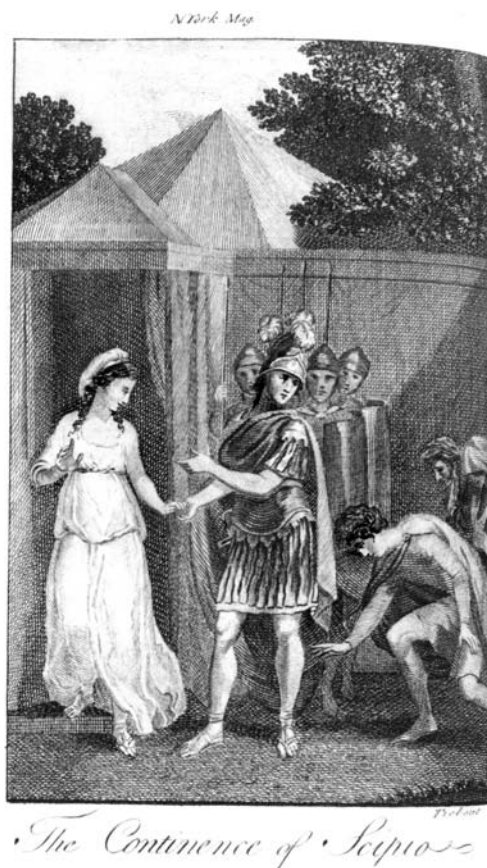
Figure 9. The Continence of Scipio . New-York Magazine , July 1793.

It is the silent woman in the parable, however, who best reveals how Americans adapted the Roman model of imperial conquest to their own national exigencies. The role of the Celtiberian maiden—the wife as gift—was archetypal in early societies where familial relations were the primary way of imagining social and political communities. Anthropologists have argued that the exchange of women was a fundamental principle in building and maintaining such groups. As part of a larger economy of reciprocity, the woman was the most valuable of gifts because she established a tie of kinship in her capacity as a wife, though she herself was not an active participant in the transaction. Such transactions, while they might appear voluntary, were in fact obligatory and agonistic because they were struggles to determine hierarchy. It is telling that the Celtiberian virgin never gets a name, in either ancient sources or modern. Instead, she is described repeatedly in early national magazines as a “prisoner,” a “present,” a “gift,” and a “captive.” In American images during the early national period, the nameless woman is passivity itself: her eyes modestly downcast, she steps delicately toward her betrothed. But though passive, she enables the most important part of the story: the reconciliation of colony and empire through the