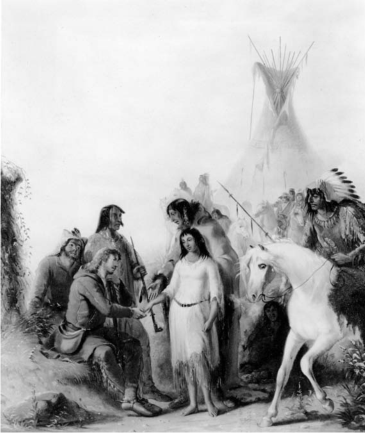
Figure 10. Alfred Jacob Miller, The Trapper's Bride (1850). Oil on canvas.

transformative act of her exchange. The wife, as a gift, appeases the colonized and aggrandizes the colonizer. 34